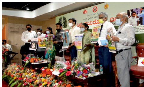
Dignitaries at the event release posters developed by KHPT