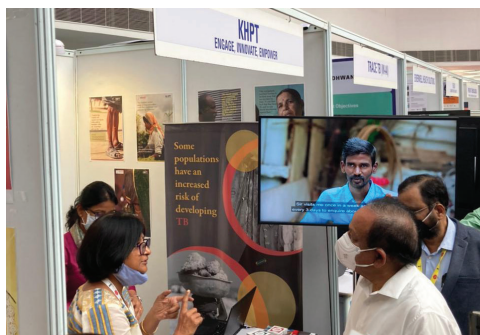
Dr. Harsh Vardhan, Health Minister at the KHPT stall

KHPT was invited to exhibit at the World TB Day event organized by the Central TB Division (CTD) at Ambedkar International Centre, New Delhi on March 24. The team showcased KHPT's community engagement work through posters, films, project briefs, and infographics. A message board was installed for visitors to send supportive messages to frontline workers. Dignitaries including Dr. Harsh Vardhan, Minister of Health, Ministry of Health