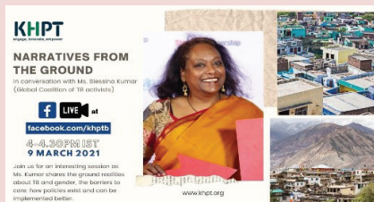
Social media post for Facebook Live

An extensive social media campaign highlighting facts and challenges related to TB, community initiatives and TB Champions' stories from the ground was successfully implemented prior to, during and in the days after World TB Day. Two Facebook Live sessions were conducted with prominent personalities, reaching more than 2000 attendees.