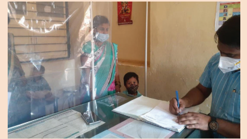
The paediatric TB screening camp at Belagavi

Belagavi is known to be one of the districts in Karnataka worst affected by malnutrition. A review of the TB patients by the BTB team in consultation with District TB Officer found that malnutrition is an issue in the intervention areas as well. The Shree Shakti Mahila Okkuta Sangh, a Self-Help Group in Ramdurg town, sought to address the issue. With support from the Anganwadi workers, the Sangh members put together a list of children suffering from malnutrition in their respective areas. A list of 32 children was drawn up, and a paediatric TB screening camp was planned for April 21 at a Designated Microscopy Centre. Due to the COVID-19 situation, only eight parents of the 32 children identified attended the TB screening camp. Four of the eight children screened were diagnosed with TB and were initiated on treatment.