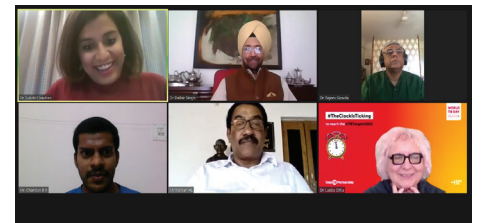
Speakers at the webinar