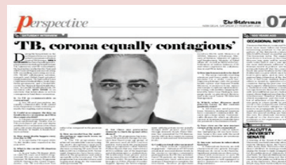
Opinion pieces in print media and television interviews