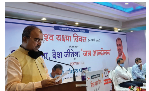
Mr. Mangal Pandey, Minister for Health, Government of Bihar, addressing the gathering

In Bihar the BTB team supported the state NTEP in organizing a month-long TB awareness campaign building up towards World TB Day. A Jan Andolan under the 'TB Harega Desh Jeetega' slogan was