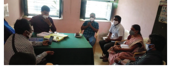
The Telangana team meets with the Warangal NTEP team at the launch of the campaign