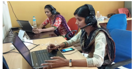
Figure 1 TB Careline

Tuberculosis (TB) is the top infectious killer in the world, and India accounts for about a quarter of the 10 million cases that occurred in 2017. TB patients are required to take a minimum of six months of treatment. However, due to an abatement of symptoms or uncomfortable side effects, they often stop taking medication, thereby raising the risk of the TB bacteria developing a resistance to drugs and becoming more difficult to treat. While TB patients are offered in-person visits by government facilities to monitor treatment adherence, many do not opt for this service because they fear being ostracized by their neighbours and relatives. Mitra, a free-of-cost phone-based ‘TB Careline’, provides not only information about TB to patients opting for the service, but also counsels them, links them back to treatment if they discontinue it, and provides feedback to providers about their patients’ status. It is staffed by a team of trained counsellors, and has been operated by KHPT since 2014, reaching out to an average of 500 new patients in Karnataka every quarter. The Careline has reached out to 15,989 patients between April 2014 and September 2020, with 7,647 patients completing treatment.