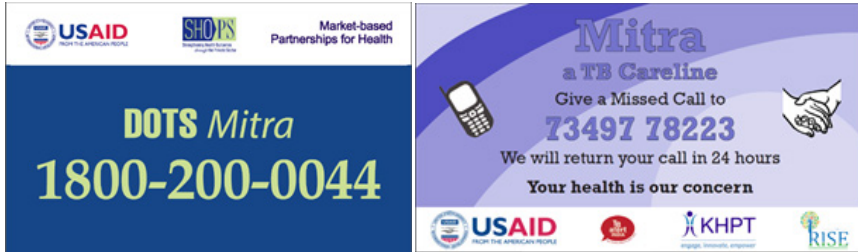
Figure 3. The Careline number was earlier toll-free under the SHOPS project and patients were given the Careline card (first row), encouraging them to give a missed call to the number. The number is currently a mobile number (second row). The cards are also available in Telugu.

(THALI), a four-year project that began in 2016, aiming to facilitate access by vulnerable populations to TB care and support services from a healthcare provider of their choice, largely in urban slum areas. The project had aimed to continue engaging with private healthcare providers and registering their patients for follow-up and counselling. However, in September 2017, due to policy changes within the funding agency, USAID, a strategic shift put an end to private provider engagement in THALI.