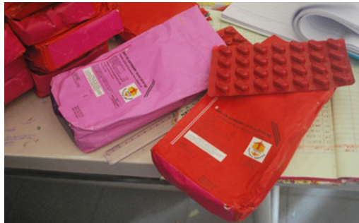
Figure 4. A course of TB medication lasts for at least six months, making adherence difficult for patients (image is only for illustrative purposes).

treatment. Families, who do not understand that the patient is non-infectious shortly after treatment begins, often place the patient in a different room, with different plates and bedding. During the THALI