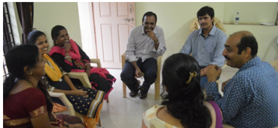
Figure 7. The Careline counsellors have discussions with the technical team on their experiences and difficult cases.

Counsellors have also lost patients because of changed mobile numbers, with no way to track them. In addition to following the call protocols, which involve calling patients lost to follow-up once in 15 days for three months, the counsellors have developed an informal protocol. “We follow up once in 15 days if a number is out of service, but we try the number weekly if it is ringing,” says Shivamma.