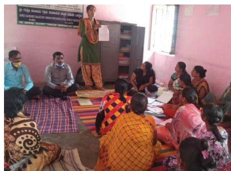
A session on POCSO in progress

To prevent gender-based violence, awareness sessions on POCSO Act and Child Marriage Act were conducted by role model adolescent girls and paralegal facilitators in 230 villages across Koppal for adolescent girls and boys. The sessions were conducted between the October-December period. The training covered offences under POCSO, punishments for those offences and child-friendly procedures to be kept in mind during the investigation of child abuse cases. Since eloping and child marriage is also rampant in Koppal, the training also specifically focused on how eloping with a person below the age of 18 years and child marriage are considered as offences under POCSO.