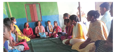
APPI staff interacting with adolescent girls

They recommended that the team include intervention for boys, a mental health intervention for adolescents, and a scholarship program for those who graduated from the Sphoorthi intervention.