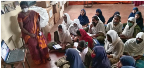
Students watching the YouTube broadcast