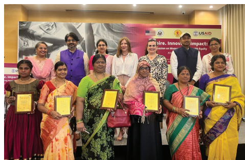
Community leaders with their felicitations with dignitaries at the International Women’s Day event