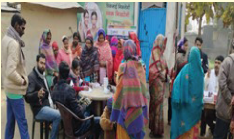
Health camp underway in West Champaran, Bihar

KHPT partnered with the District NTEP teams of West Champaran, Bhagalpur, and Purnia to organize health camps. These camps aimed to raise awareness about TB symptoms, screening, prevention, and care services. In January, a total of 44 camps across the three districts were organized, reaching out to 20451 people with information on TB symptoms, diagnosis, treatment and prevention. Among those present 12278 were screened, 183 symptomatic persons were referred for TB testing.