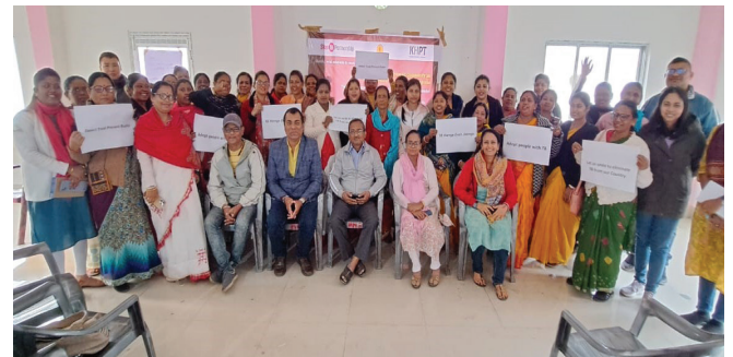
CRG training at Pandu TU, Assam

officer. Similar trainings were held in Bengaluru, between February 6-8, 10, 16, and 18 for 125 sex workers and 28 for MSMs and TGs. These trained individuals are expected to become advocates for change, leading efforts to mitigate TB-related stigma and promote the rights and well-being of those affected by TB, especially women and sexual minorities.