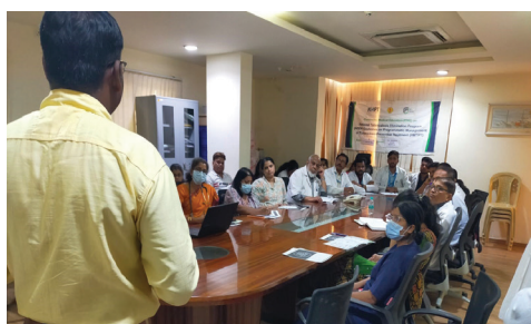
CME training being conducted at Bagalkot

JEET worked in collaboration with the NTEP to organize Continuing Medical Education (CME), programmes for private providers in Bengaluru City, Bengaluru Urban, and Belgaum districts.