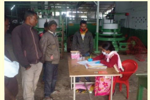
Factory workers being screened for TB, Dibrugarh, Assam

District NTEP, Dibrugarh, and Maijan Tea Estate administration collaboratively organized a TB screening programme for factory workers on February 22. The programme involved an awareness session led by the Senior Treatment Supervisor (STS), Senior Tuberculosis Laboratory Supervisor (STLS), and the Tea Estate's Medical Officer. Following the session, 60 workers were screened for TB, and 42 samples were collected for testing.