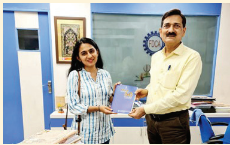
A KHPT team member meets the Commissioner, FDCA, Gujarat