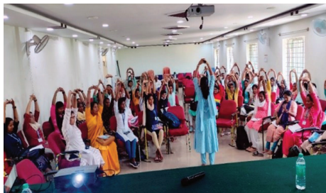
Training for the CHOs on ECCD at Tumakuru

KHPT organized a one-day training on May 24 for Community Health Officers (CHOs) on preconception care at the Department of District Health and Family Welfare, Tumakuru.