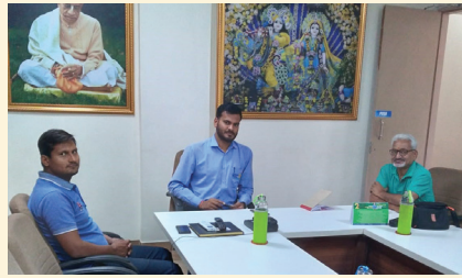
■ KHPT meets with Akshaya Patra officials

KHPT held a meeting with Akshaya Patra Foundation, Bhopal, on the provision of fortified wheat flour in meals to school