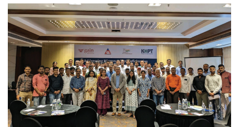
Participants of the milk fortification training at Pune

KHPT conducted a state-level training on May 9 for 60 participants from 35 milk dairies on the process of milk fortification. About 60 participants from 35 milk dairies participated in the training, which was comprised of classroom sessions, as well as on-site training at Katraj Dairy. Participants were sensitized on the need for and importance of milk fortification, FSSAI regulations, and the technical aspects of the fortification process. Interested milk dairies will be provided with technical support to start milk fortification for their respective brands.