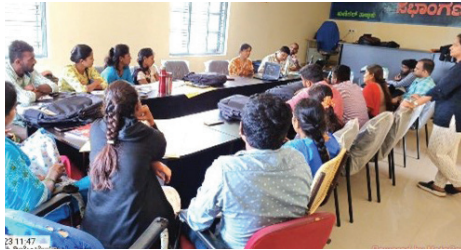
■ Training of CFs on observation skills and identifying case stories

KHPT organized a one-day training for the Community Facilitators in Kunigal block on observation skills and documenting case stories, with the aim of capturing learnings, best practices and success stories. The session, held on June 22, focused on importance of making observations during field visits, how to observe effectively, the importance of identifying case stories and how to write case stories.