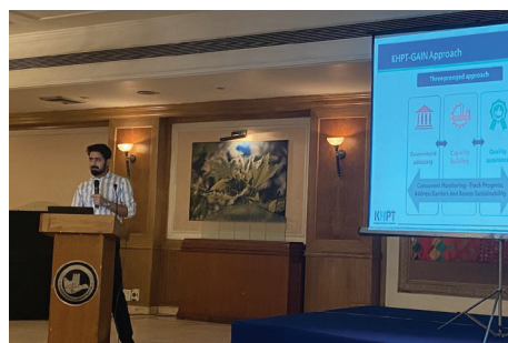
A KHPT team member presents success stories and approaches at the seminar

KHPT was invited to a roundtable meeting conducted by the Food Safety and Standards Authority of India held on February 23 with representatives from various food safety net schemes of Chhattisgarh. The representative of the Integrated Child Development Scheme (ICDS) informed the participants that fortified rice and fortified wheat flour are currently being distributed through the scheme in all 33 districts, and suggested that there is a scope for the inclusion of fortified edible oil and double-fortified salt in the scheme. KHPT followed up with the Food and Drug Administration of the state and ICDS representatives on the suggestions to move ahead with the discussion points and is planning trainings for edible oil industry representatives.