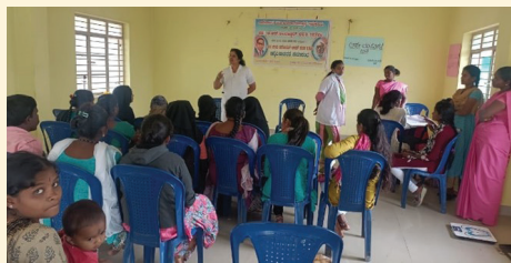
■ The first EC day at Bilidevalaya HWC focusing on preconception care

The KHPT team evolved a strategy for strengthening preconception care among the Eligible Couples after a series of interactions with community members, frontline workers, block-level officials and members of the Gram Panchayat Task Force (GPTF). This approach, called 'Eligible Couple's' (EC) Day is aimed at mobilizing eligible couples to visit Health and Wellness Centres (HWC) for health screening, sensitize them about the importance of preconception care and pregnancy readiness, as well as the role of husbands in ensuring the