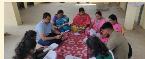
■ Piloting the EC card at Ippadi PHC area

KHPT has developed a draft Eligible Couples (EC) card, which is intended to be not only a useful information resource on the need for health screening, pregnancy preparedness, and preconception care, but also a health record for husband and wife for common health concerns including hypertension, diabetes and anaemia. The card was issued to 98 Eligible Couples in the intervention area in Tumakuru, and the team interacted with the beneficiaries who received the EC card and the frontline to consolidate their feedback and suggestions for its improvement. The suggestions were consolidated and incorporated into the EC card, the second version of which is to be rolled out for testing.