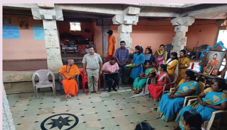
■ Government Officials addressing at the Soft Skills and Communication Skills Training of FLWs

KHPT organized a two-day training program on soft skills, focusing on self-development