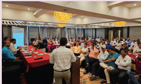
■ Divisional Level Sensitization Workshop in Varanasi, UP

In Uttar Pradesh, Divisional Level Sensitization Workshops were conducted across seven divisions from July 4 to August 4, including Gorakhpur, Meerut, Agra, Lucknow, Moradabad, Bareilly, and Varanasi. About 258 participants attended these workshops, including 119 from edible oil industries, 21 from milk dairies, and 113 Food Safety Officials.