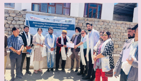
■ Handing over training completion certificate to Kargil Roller Flour Mill

targeting key districts and divisions. In Haryana, a District Level Sensitization Workshop was held on August 23, in Ambala City. This workshop focused on Ambala, Kurukshetra, and Yamuna Nagar districts. Approximately 25 representatives from edible oil and wheat flour industries attended the workshop. KHPT