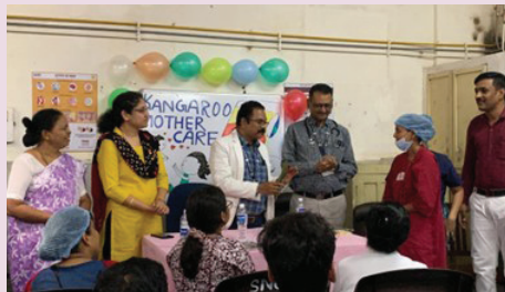
■ KMC Ward inauguration at Central Hospital Ulhasnagar, Mumbai