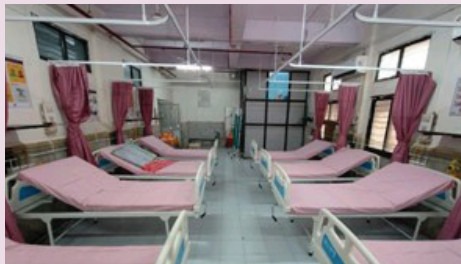
■ KMC Ward at Central Hospital Ulhasnagar, Mumbai

KHPT, in collaboration with partners and staff of the Central Hospital, Ulhasnagar, Mumbai, organized the inauguration of a Kangaroo Mother Care (KMC) ward at the hospital on September 14. The ward is designed to provide mothers with a dedicated space and hands-on support to provide prolonged KMC to their