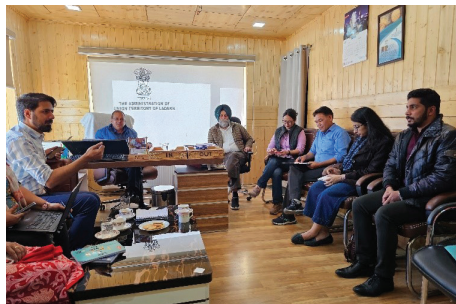
■ KHPT team meets with Secretary, Department of Food Civil Supplies & Consumer Affairs, Ladakh