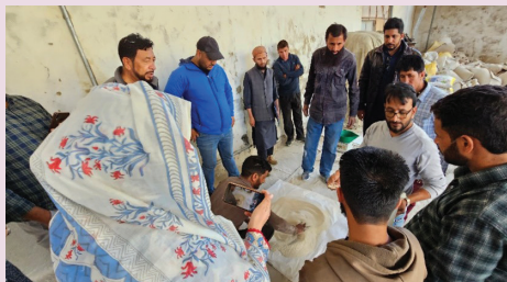
■ On-site training to Flour Mill on wheat flour fortification in Kargil, Ladakh

The KHPT team conducted on-site training sessions on July 12 and 13, with a focus on wheat flour fortification for three roller flour mills located in Ladakh. These mills play a crucial role as suppliers of wheat flour to PDS