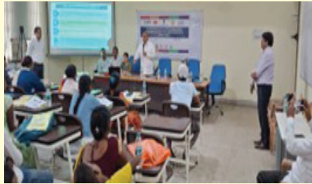
TB Champion capacity building training in Patna, Bihar

in Sitamarhi and Darbhanga, Bihar, as well as in Bengaluru Rural, Karnataka, on 19 and 20 September. The objective of this training was twofold: to equip survivors with essential skills and knowledge about TB management, and the National Tuberculosis Elimination Programme (NTEP), while also reducing TB-