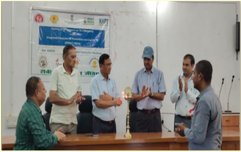
TB Champions capacity building training inauguration in Bengaluru Rural, Karnataka

KHPT conducted capacity-building training for TB survivors, designating them as TB Champions