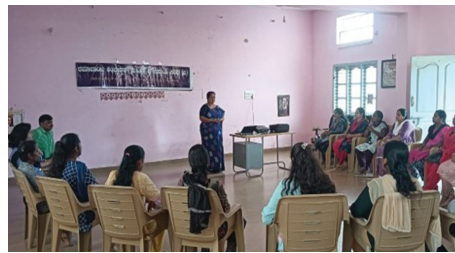
Training session for TB volunteers to strengthen community response to TB in Mysuru

Through this initiative, KHPT identified 67 Volunteers, with 43 receiving focused training on critical topics such as TB awareness, infection control measures, and patient counselling. The programme also ensured that these volunteers benefit from ongoing supervision and support from healthcare professionals, enhancing their effectiveness in delivering care. The team plans to conduct refresher training sessions to reinforce the knowledge gained during the initial training.