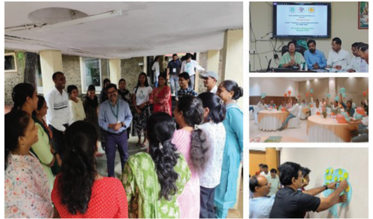
NTEP staff attending training conducted by Saksham on counselling skills for Persons with TB

During the quarter, Saksham Pravaah made significant strides in its initiative to enhance counselling skills for TB care. A total of 712 NTEP staff members were trained across Madhya Pradesh, Maharashtra, Gujarat, Jharkhand, Meghalaya, Mizoram, Karnataka, Kerala, Andhra Pradesh, Tamil Nadu, Chhattisgarh, Goa, Himachal Pradesh, Uttar Pradesh, Rajasthan, Uttarakhand, West Bengal, Chandigarh, and Andaman and Nicobar, laying a strong foundation for improved patient support and counselling nationwide.