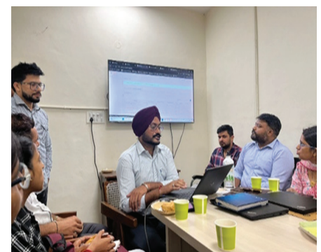
Training regarding DBT and query escalation, Chandigarh