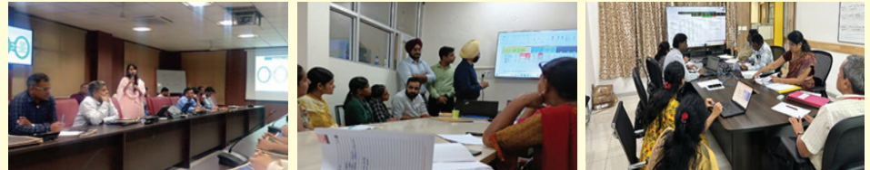
PMTBMBA state teams facilitating District Review Meetings across India

The primary objectives of these meetings were to enhance engagement with Nikshay Mitras to ensure effective enrolment and support for