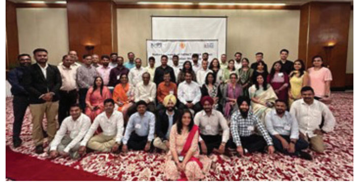
KHPT team at the IMPACT India project launch, New Delhi

and Panchayati Raj Institution (PRI) engagement, backing the Pradhan Mantri TB Mukht Bharat Abhiyaan (PMTBMBA) and Direct Benefit Transfer (DBT) initiatives, and training frontline TB staff.