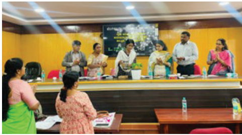
Bangalore Chief Executive Officer inaugurating district GPTF training

Following this, district-level TOT sessions were conducted in two phases throughout August and September, reaching 1,582 participants from various sectors, including Rural Development and Panchayat Raj (RDPR), Women and Child Development (WCD), Health and Family Welfare (H&FW), and district training coordinators from SIRD. This extensive capacity-building initiative aims to cascade training to cover 5,951 Gram Panchayats across Karnataka.