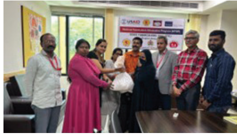
PwTB receiving nutrition kit from State Tuberculosis Cell, Bengaluru

Swaminarayan Gurukul Sansthan in Rajkot, Gujarat, will provide nutritional kits to 1,000