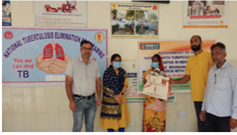
PwTB receiving a nutrition kit by ONGC, Mehsana, Gujarat

In addition, FICCI FLO in Jammu pledged to adopt 100 PwTB, and the faith-based organisation