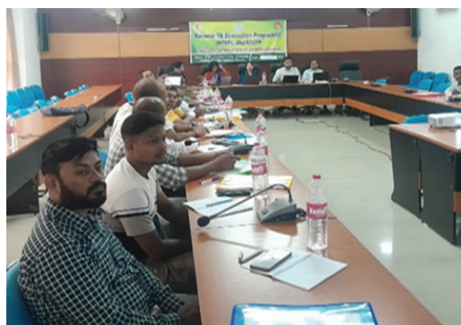
Training cum review of DBT performance, Ranchi

To facilitate effective communication and data monitoring, a state-level WhatsApp group was established, along with dedicated spreadsheets to streamline data collection and track Nikshay Mitra activities.